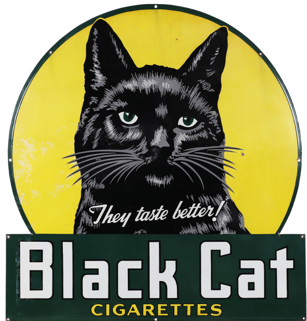
Black Cat Cigarettes porcelain sign (Canadian, 1940s), 50 ½ inches by 48 inches, one of the most attractive porcelain signs in Canadian advertising history (CA$10,516).

Following are additional highlights from the auction, which grossed $515,188 (including the buyer's premium). The sale attracted 671 bidders, who placed a total of 10,393 bids online, via LiveAuctioners.com and MillerandMillerAuctions.com. Nearly 60 percent of lots brought prices that met or exceeded estimates, while 26 percent of lots surpassed even the high-end estimate.