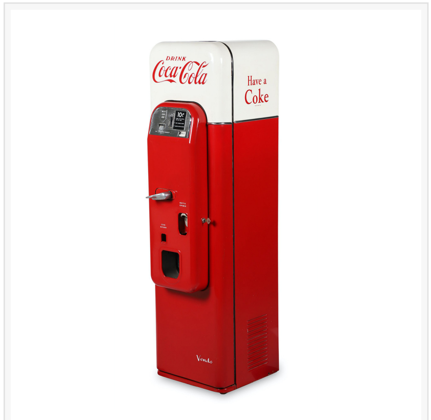
Coca-Cola Vendo '44' vending machine, an all-steel original 'survivor' stamped "The Vendo Company, Kansas City" and made for the Canadian market in the 1950s (CA $9,348).

This press release can be viewed online at: https://www.einpresswire.com/article/532943868 EIN Presswire's priority is source transparency. We do not allow opaque clients, and our editors try to be careful about weeding out false and misleading content. As a user, if you see something we have missed, please do bring it to our attention. Your help is welcome. EIN Presswire, Everyone's Internet News Presswire™, tries to define some of the boundaries that are reasonable in today's world. Please see our Editorial Guidelines for more information. © 1995-2020 IPD Group, Inc. All Right Reserved.