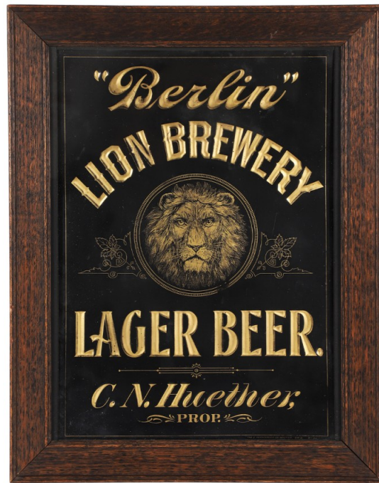
Rare 'Berlin' Lion Brewery tin litho sign, Canadian, 1901, the only example known to exist, 14 inches by 19 inches (sight, less oak frame), the center depicting a lion's head (CA$8,179).

A National Cash Register Company floor model 106-6-A, one of NCR's most visually impressive and complex machines, built for "D.W. Henry, Springfield, Ont.", 65 inches tall, fully functioning and professionally restored, rang up $4,967. Also, a rare and historically significant early Bell Canada mahogany 3-box magneto wall telephone, containing the early "Blake Transmitter"