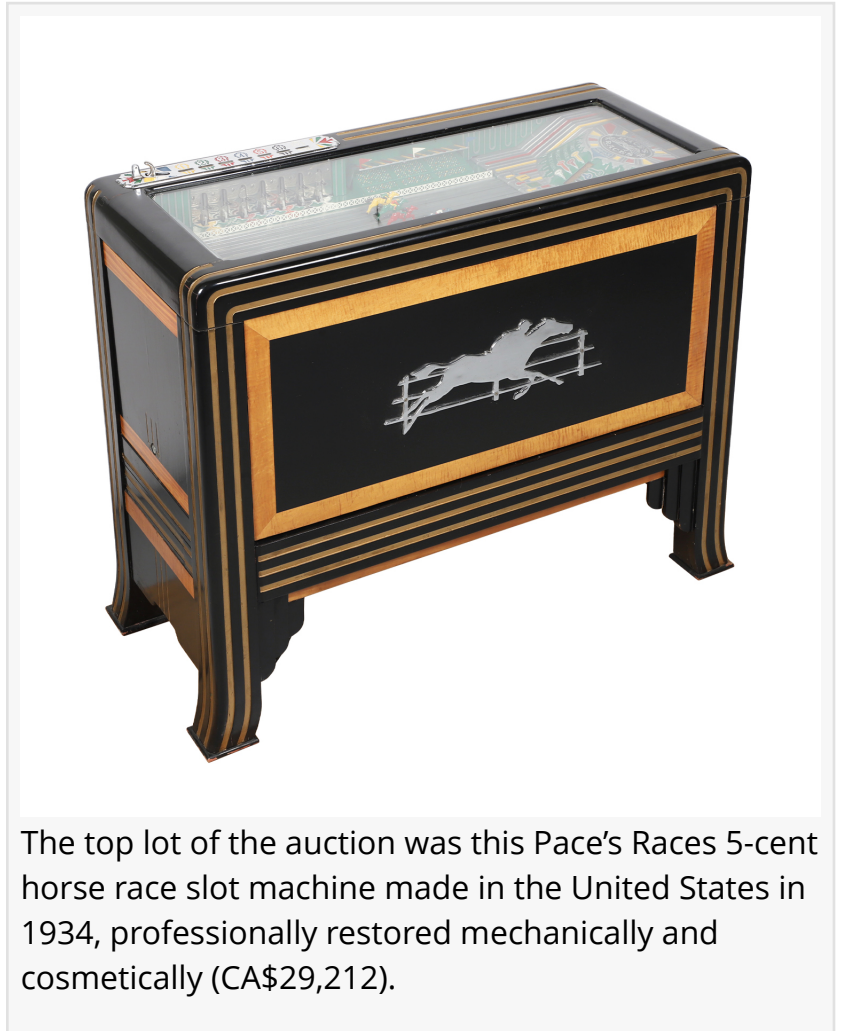
The top lot of the auction was this Pace's Races 5-cent horse race slot machine made in the United States in 1934, professionally restored mechanically and cosmetically (CA$29,212).

The Black Cat Cigarettes porcelain sign, measuring 50 ½ inches by 48 inches, is widely seen as one of the most attractive porcelain signs in Canadian advertising history. A green-eyed black cat was shown with the statement, "They taste better", with "Black Cat Cigarettes" in script beneath that. It was marked "St. Thomas Metal Signs" on the lower edge and only had minor blemishes.