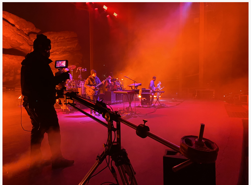
Lotus at Red Rocks