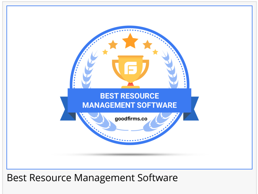
Best Resource Management Software

WASHINGTON DC, WASHINGTON, UNITED STATES, December 17, 2020 /EINPresswire.com/ -- Today, many project planners and organizations have started investing in the resource management tool. It allows scheduling, allocating, analyzing, tracking, and managing resources such as staff, space, and equipment to complete the projects. There are several software providers in the market, which has made it challenging for the service seekers to select the right system. For the same reason, GoodFirms has revealed the list of Best Resource Management Software based on several research criteria.