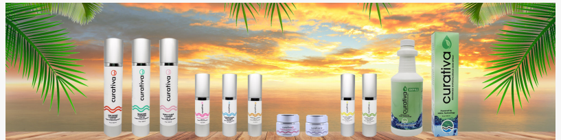
These are SkinCare Products that Get Results

This press release can be viewed online at: https://www.einpresswire.com/article/533007584