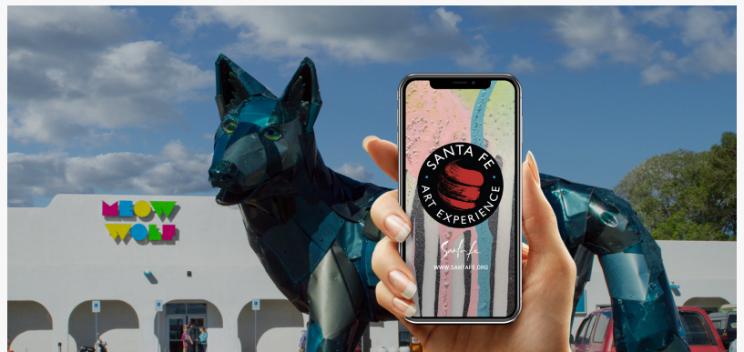
The Santa Fe Art Experience helps art lovers find all the art and galleries in Santa Fe.

The SANTA FE ART EXPERIENCE is also more than an app. It also builds community through its Website, Facebook and Instagram social channels, Newsletter and text alerts, which will support events and openings for all participating galleries and museums. A swag store preps you with attire and even facemasks.