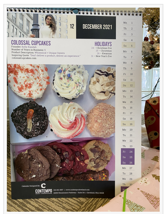
Colossal Cupcakes/December 2021