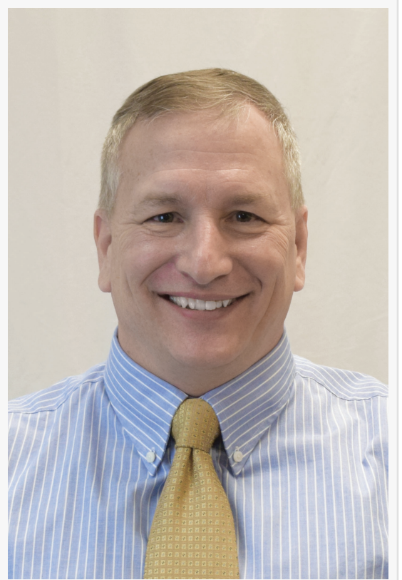
Photo of author

This press release can be viewed online at: https://www.einpresswire.com/article/533149069