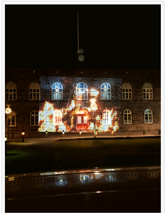
Mortal Kombat on Parliament.

© 1995-2020 IPD Group, Inc. All Right Reserved.