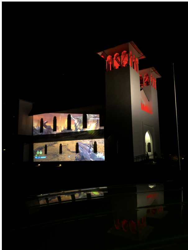
Playing DOOM on a local church.