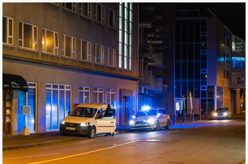
Stopped by the police.

“The Police didn’t like it one bit, and asked me several times if I had a permit for what I was doing. Which I didn’t. But they didn’t find any laws that I was breaking, and were forced to let me