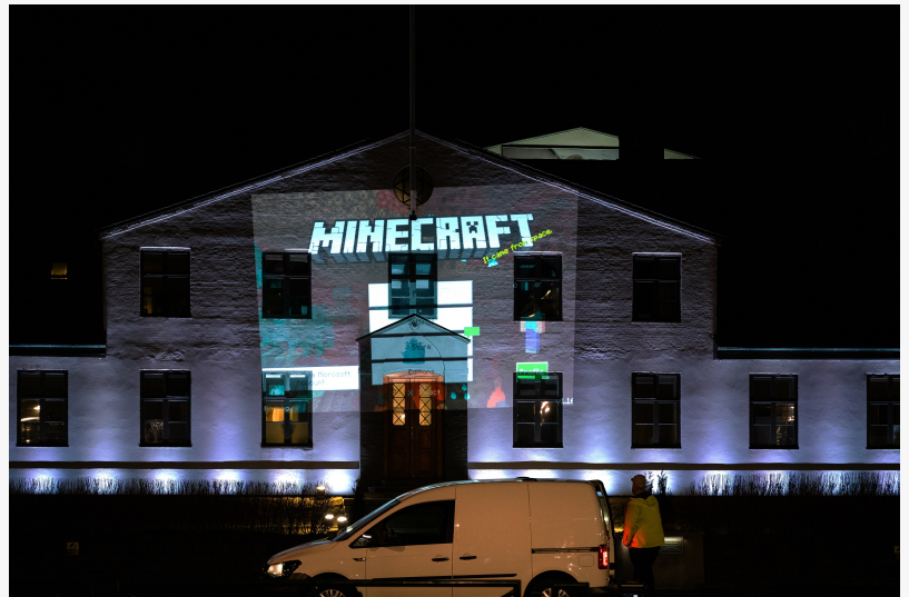
Playing on the Prime Ministers office.