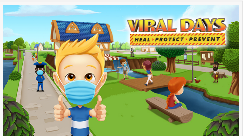
Viral Days title screen

That frame appears, adjusts, and disappears dynamically. As a healthy person spends time in