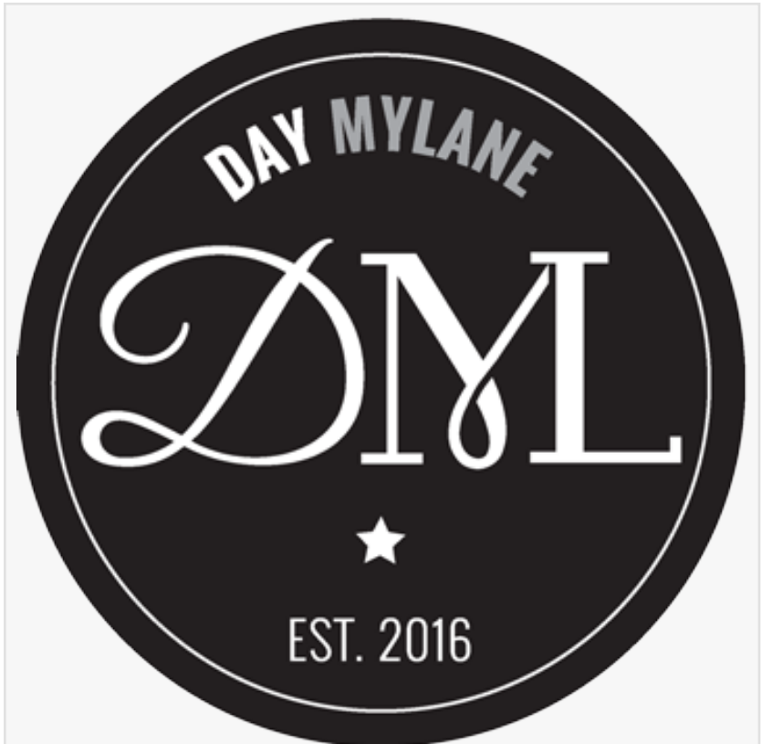
Day MyLane Logo

A spin on the English phrase "Stay in your lane," the company's name has roots in both English and Nigerian languages. In Nigerian Pidgin English, it is not uncommon for someone to say "Dey your lane," hence the aesthetically soothing version was born, Day MyLane. Nigerian Pidgin English phrases are highlighted throughout the brand's website and are creatively represented on a number of pieces.