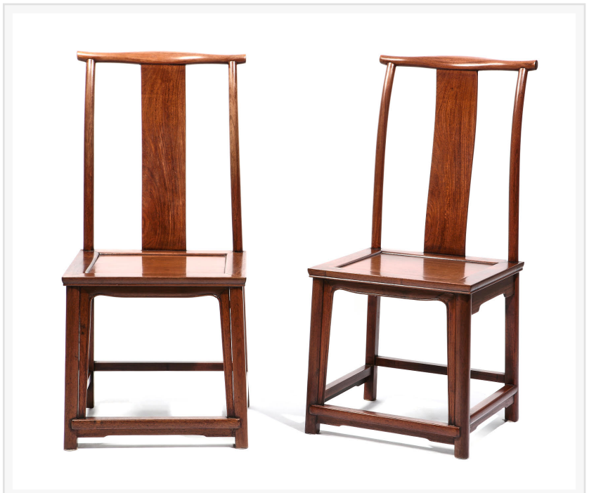
Pair of Chinese hardwood side chairs, height 41in (104cm); width 19in (48cm); depth of seat 16in (40.5cm), estimate $10,000-$15,000.

Furnishings and accessories range from antique English vernacular to mid-century modern, with examples that include a George III oak settee, 18th century (est. $800-$1,200); a William and