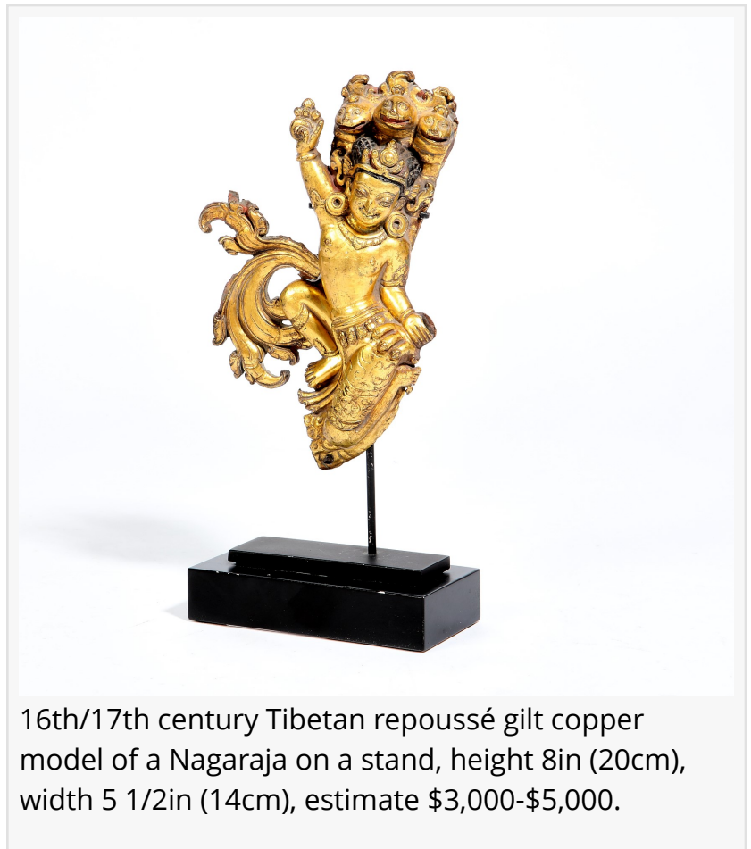
16th/17th century Tibetan repoussé gilt copper model of a Nagaraja on a stand, height 8in (20cm), width 5 1/2in (14cm), estimate $3,000-$5,000.