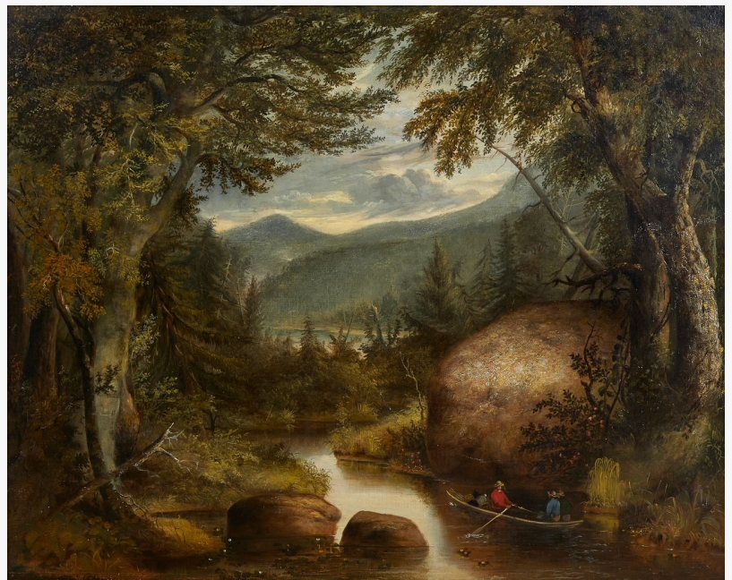
19th century oil on canvas Hudson River School painting titled View Between 6th & 7th Lake, John Brown Track (North Woods), Rockwell Pt., estimate $3,000-$5,000.