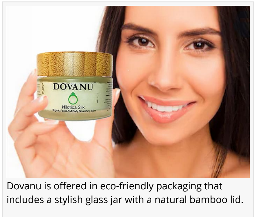
Dovanu is offered in eco-friendly packaging that includes a stylish glass jar with a natural bamboo lid.

All this underscores the current expansion in the marketplace for natural, high-quality, organic products.