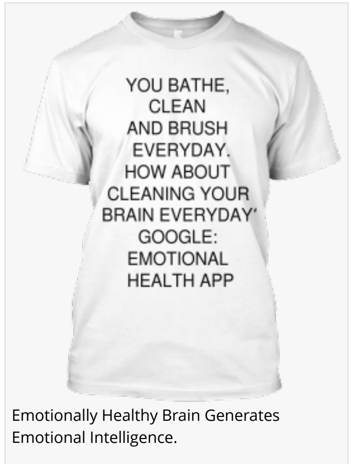
Emotionally Healthy Brain Generates Emotional Intelligence.

Please use the ethnic, qualified, and diverse power of the Biden-Harris cabinet to ensure the success of Rev. Warnock and Ossoff.