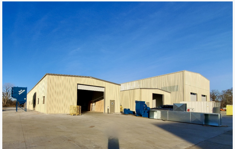
Three new manufacturing buildings at Custom Dredge Works, Topeka KS

TOPEKA, KANSAS, UNITED STATES OF AMERICA , December 28, 2020 /EINPresswire.com/ -- Custom Dredge Works nears completion of a $3.5 million expansion of its manufacturing facilities located in North Topeka, Kansas. The expansion includes three new buildings, including buildings dedicated to Sand Blasting, Painting, and Dredge Assembly. The buildings include new metal fabrication, blasting and painting equipment, as well as large overhead Gantry Cranes that facilitate the smooth and safe movement of dredges and components through the CDW manufacturing 'line'.