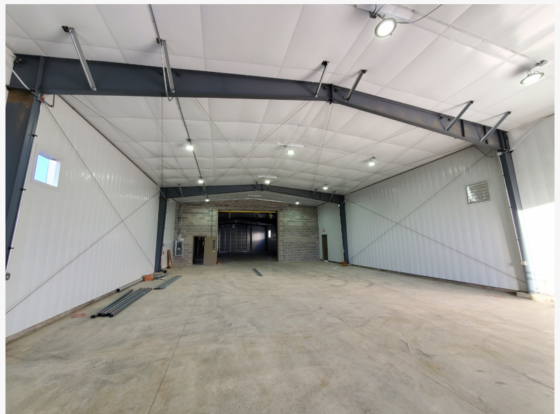
Inside Building Two

Cash McCloy CUSTOM DREDGE WORKS +1 785-220-0555 Cash@CustomDredgeWorks.com Visit us on social media: Facebook LinkedIn