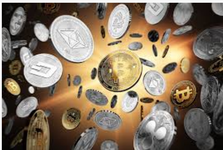
Crypto Trends 2020

As Buckminster Fuller said: "You never change things by fighting against the existing reality. To change something, build a new model that makes the old model obsolete."