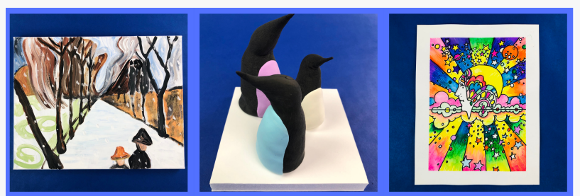
January Monthly ART BOX Projects