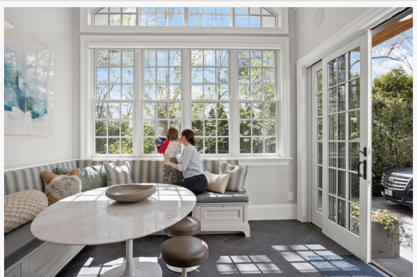
Inside the Addition

A uniquely creative Architectural Design Build firm grounded in sustainable aesthetics and luxury home design, NEDC recently began designing and retrofitting a client home in Somerville, Massachusetts to Passive House standards--a challenge that is ground breaking even for Boston, a city known internationally for its willingness to push boundaries and innovate.