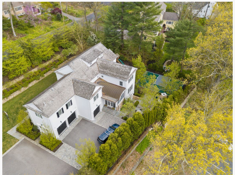
Exterior Showing Custom Wellesley Addition

A multi-ethnic, young, talented team of creatives with diverse backgrounds stand proudly at the