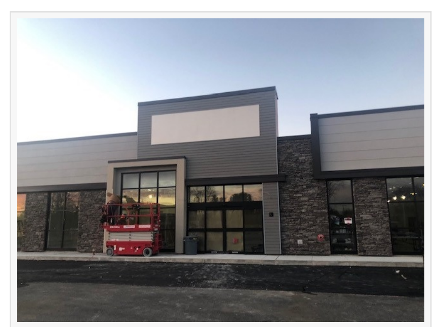
University Orthopedics is slated to open its new location in Mansfield, Mass. on February 1, 2021.

"University Orthopedics is pleased we're able to bring the same highquality orthopedic care for which we're known to the residents of