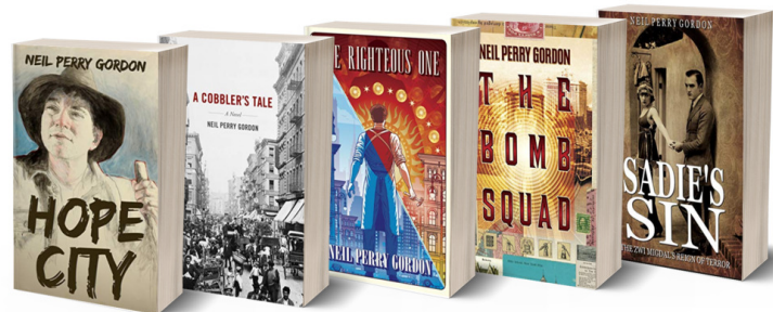
Neil's 5 books