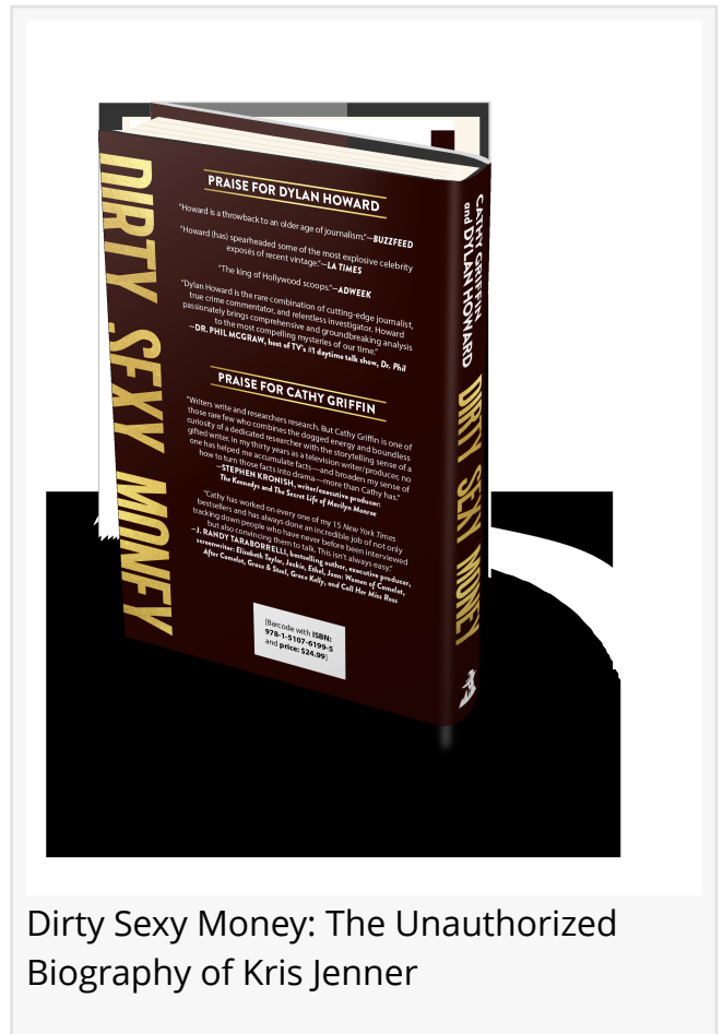
Dirty Sexy Money: The Unauthorized Biography of Kris Jenner