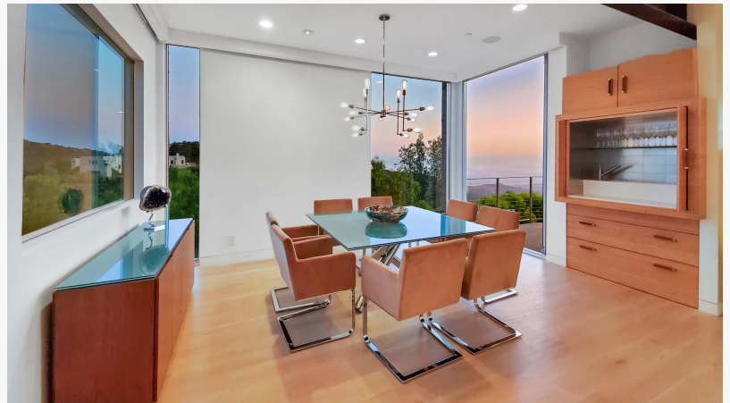
Fully sustainable with all materials made in the US