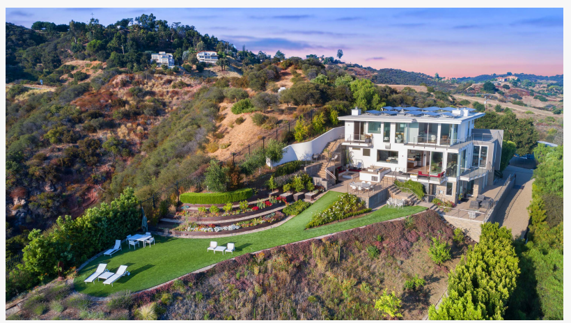
Estate occupies a hillside perch

Concierge Auctions offers a commission to the buyers' representing real estate agents. See Auction Terms and Conditions for full details. For more information, including property details, exclusive virtual tour, diligence documents, and more, visit ConciergeAuctions.com or call +1.212.202.2940.