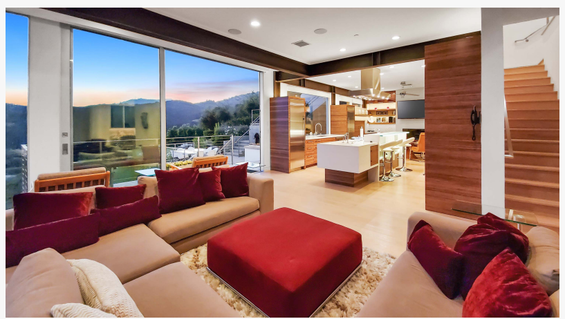
Serene palette of glass, steel, concrete, and bamboo

As part of Concierge Auctions' Key for Key® giving program in partnership with Giveback Homes,