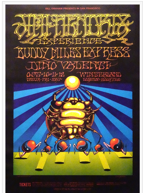
Jimi Hendrix Experience Bill Graham BG-140 concert poster, 1968, Winterland Ballroom, San Francisco. Original first printing. Artists: Rick Griffin and Victor Moscoso. Est. $3,000-$4,000