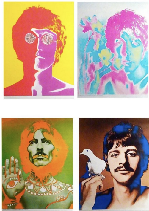
The Beatles, Richard Avedon poster/print set commissioned by The Beatles merchandising company NEMS, each 27in x 18¾ in, 1967. Est. for set: $1,500-$2,000