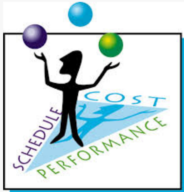
PHC for Performance Improvement