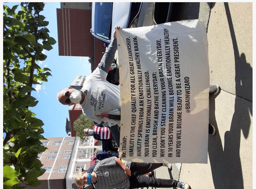
This is the truth about Trump.

From the above test, we can see that Biden is a +2 leader, emotionally fit, which means he is wisdom qualified. One of Biden's exceptional qualifications is that he is not the last word in the room for professional expertise. He always seeks the best possible advice. So he always chooses the best and the brightest to optimize American successes and minimize failures. He will replace lapdogs with cutting edge experts, each the top expert in their department, leaders who will bring real progress in every sector of life. The Social Progress Institute, which consists of several eminent Nobel Prize winners, has called for action to stop America's social decline. They have certified that Trump and his lapdogs have hastened America's decline.