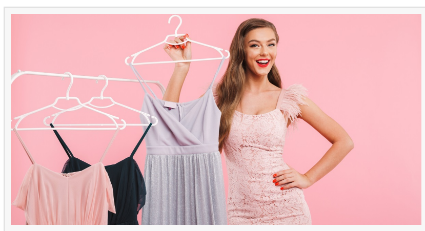
Ladies Fashion Clothing

Every woman must have a style that suits the occasion. The right outfit can make a woman look chic, stylish, elegant and personable simply because it will get the right attention from the right qualified person. The process of selecting the right outfit can be simplified by keeping a few simple points in mind.