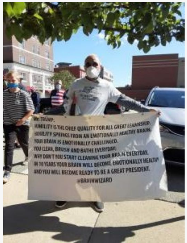
A banner i displayed at Trump Tower for months

Trump will soon be out of the White House, but he will still illegally and immorally control the likes of Perdue and Loeffler from the outside. He will use them to do everything in his power to sabotage Biden-Harris's truly incisive American agenda. Even though Trump legally and morally cannot control the senate when he lost the White House, his lapdogs Perdue and Loeffler will still obey his every insane move. Perdue and Loeffler are in the full grip of Trump's insane gut. Ask yourself if you can afford to give senate power to Trump's insanity.