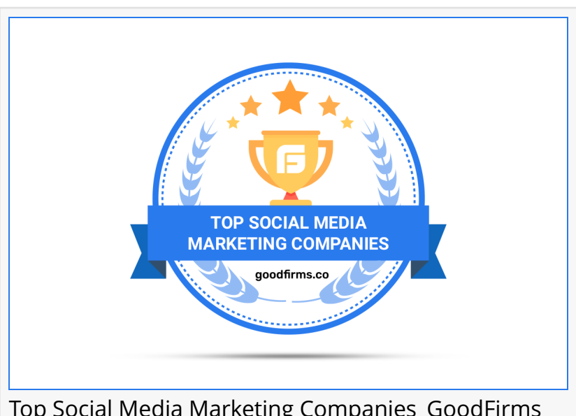
Top Social Media Marketing Companies_GoodFirms

WASHINGTON DC, WASHINGTON, UNITED STATES, January 4, 2021 /EINPresswire.com/ -- Social Media has revolutionized the modern world by providing the fastest way for a brand to connect to a consumer. Thus, today social media marketing has changed the old forms of advertising. Presently, various industries are implementing social media marketing to promote