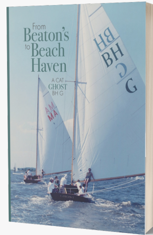
From Beaton's to Beach Haven: A Cat Ghost Bh G

With its great build, Ghost won seven consecutive Bay championships from 1994 to 2000 and competed for 22 years nonstop. But it did not reach fame for greatness without hiccups. Aside from its victories, Ghost's first