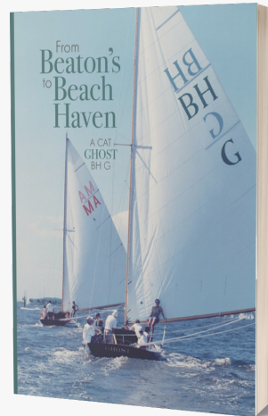
From Beaton's to Beach Haven: A Cat Ghost Bh G