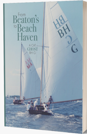
From Beaton's to Beach Haven: A Cat Ghost Bh G