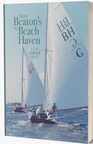
From Beaton's to Beach Haven: A Cat Ghost Bh G

The book wouldn't disappoint anyone who loves boats and sailing. Fortenbaugh filled the book with color