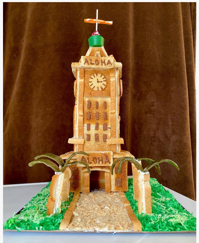
Toasty House Winner - Aloha Tower

Hilo Hattie / Hawaiian Air Cargo Partners