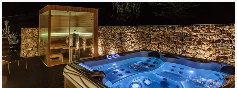
the ego3 hot tub filter is available for all spa brands

In these countries, customers from more than 30 hot tub manufacturers are now supplied with