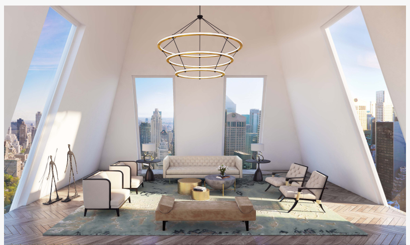
Perched thirty-seven floors above the 50-yard line of Central Park South on Billionaire's Row.

Framing the incredible city and Central Park, a view that will never change, the award-winning design calls for 9,650 square feet of interior and exterior space with walls of glass, skylights, and oversized windows to bring the outside in and create an abundance of natural light. With outdoor living to span an incredible 1,125 square feet, any one of four terraces, including a private Central Park-facing terrace off the master—becomes the perfect backdrop for formal or casual entertaining. A potential viewing gallery will offer unobstructed skyline views, no matter the season.