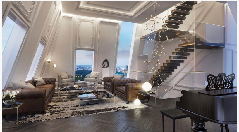
Hampshire House has oversized windows to bring the outside in and filter in an abundance of natural light.