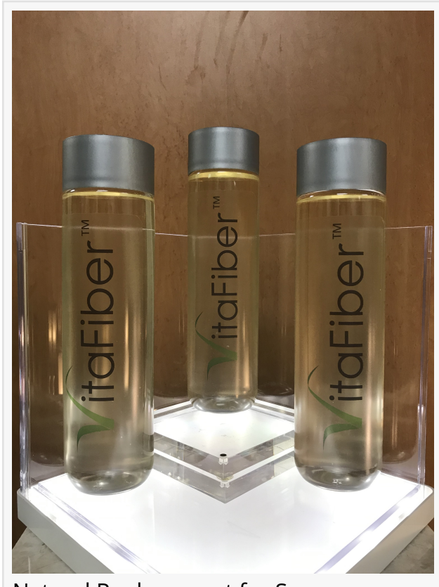
Natural Replacement for Sugar

VitaFiber® IMO has been approved for sale by the world's top three health regulatory bodies – GRAS approved by the US Food & Drug Administration; the European Food Safety Authority and Health Canada (approved as a novel food ingredient). Additionally, VitaFiber® IMO has been approved as a dietary fiber by Health Canada. VitaFiber® IMO is a naturally sweet, lower calorie alternative to sugar and is a natural source of dietary fiber and prebiotic for human digestive health. It is also helpful with <a href="weight management">weight management</a>. VitaFiber® IMO is also non-GMO, vegan friendly, gluten-free, Kosher and Halal certified and available as certified organic.