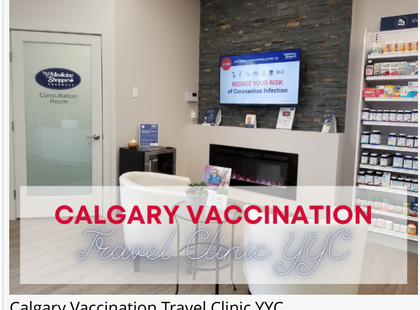
Calgary Vaccination Travel Clinic YYC

Their new website shows all the vaccines and flu shots they offer to