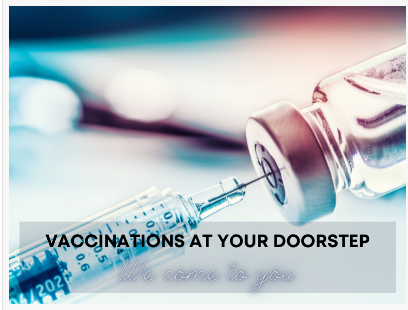
Vaccinations at your doorstep - We come to you