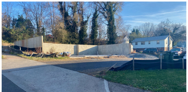
Oak View Street, Culpeper, VA