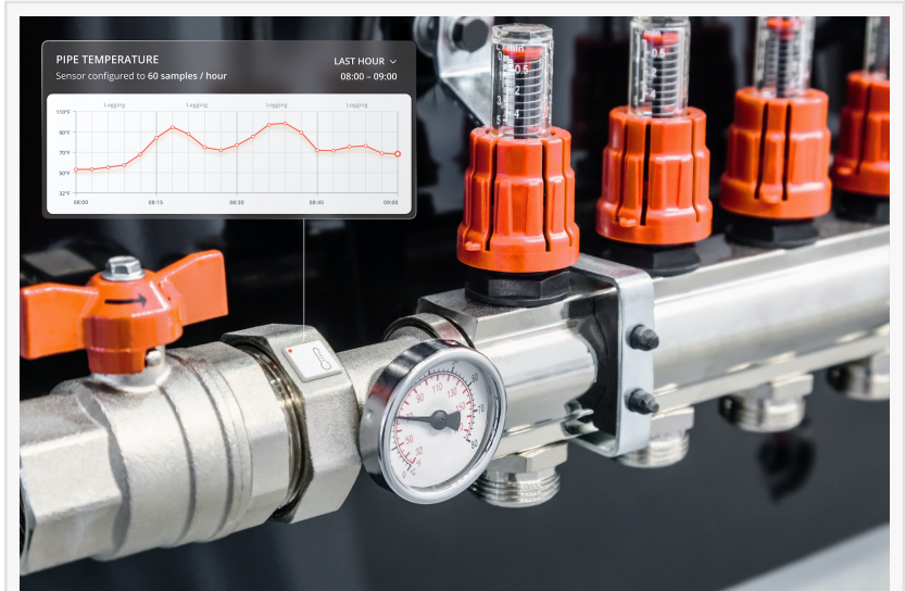
This sensor is ideal for water pipe monitoring (ensuring legionella compliance & water safety)