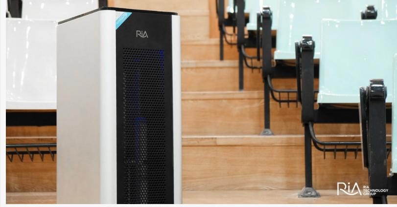
RIA in the College