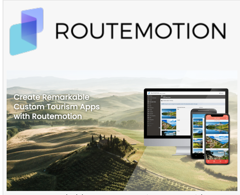
Create Remarkable Custom Tourism Apps with Routemotion

When Wine Travel Card first came to Routemotion, they needed a way to upgrade their printed passport program in which they provide local