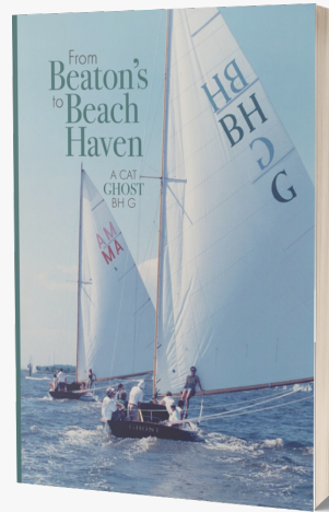
From Beaton's to Beach Haven: A Cat Ghost Bh G