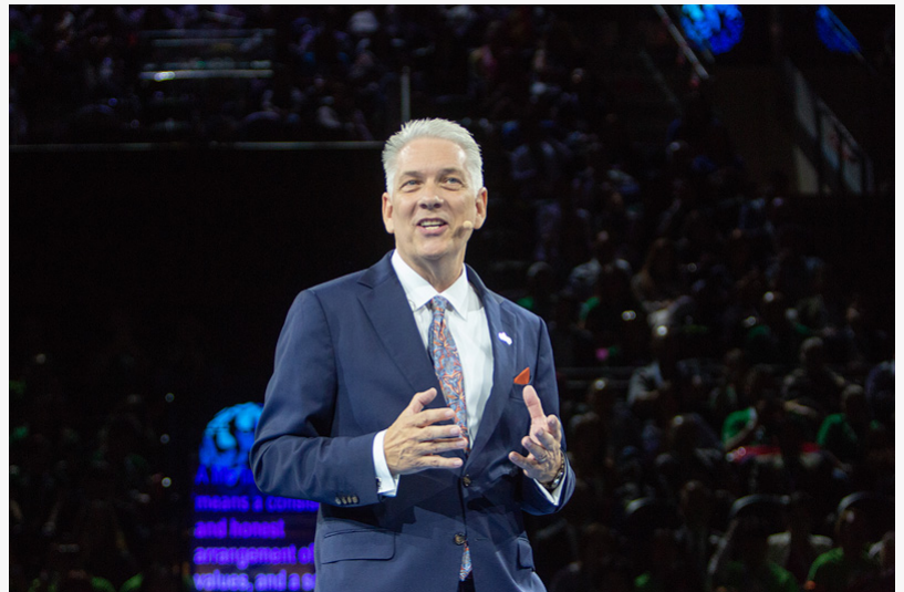
Bestselling Author & Global CEO shares principles for success as we emerge from the pandemic.

success and makes life more harmonious for everyone."