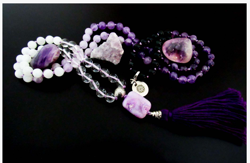
The Purple Ombre Semi Precious Gemstone Meditation Beads

In addition, Durga's collections also include a wealth of information specific to each piece, along with helpful suggestions and tips to ensure a successful regular or daily meditation practice, should one seek to do so.