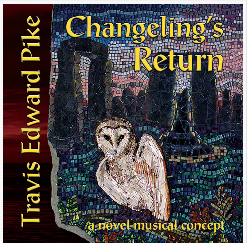
CD Cover for Changeling's Return