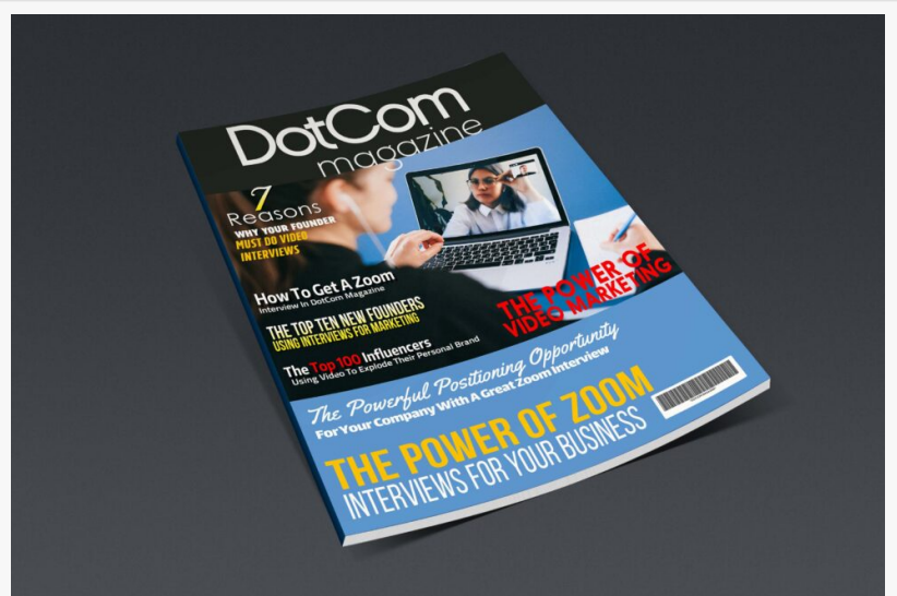
DotCom Magazine "The Zoom Interview Issue"