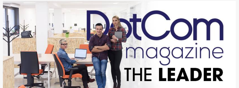
The DotCom Magazine Entrepreneur Spotlight Series