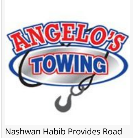
Nashwan Habib Provides Road Safety Tips That Could Save Your Life

you've suffered a breakdown, you should try to get out of the way of traffic, say pulling to the side of the road. If you've been in an accident, dial 911."