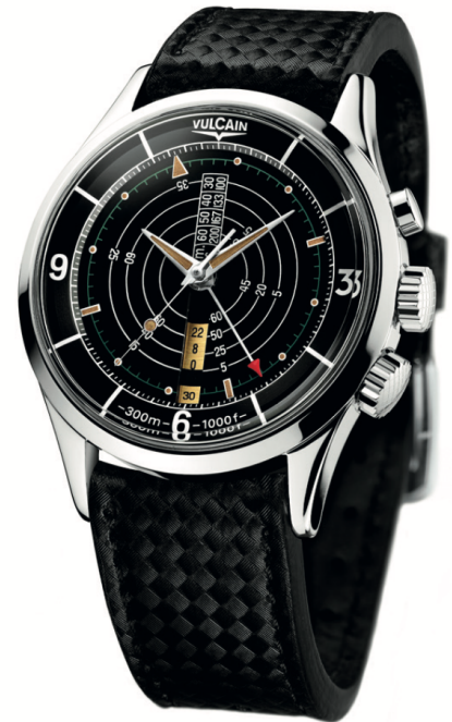
VULCAIN launched its "Nautical" diving watch, with an audible movement underwater!