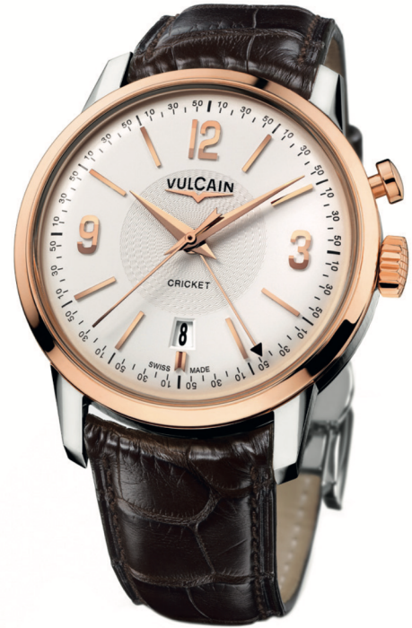
Vulcain Cricket™ alarm wristwatch

Back in 1961, VULCAIN launched its "Nautical" diving watch, with an audible movement underwater!