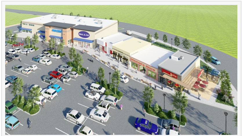
Ephraim Crossing retail complex

Currently, development is underway for 44-home Estates at Ephraim Crossing. Once complete, residents will be able to have the benefits of city living with small town comforts in their choice of single-family homes, townhouses or apartments. "No matter what their choice, all housing options will be affordable for the area," said Ballard.