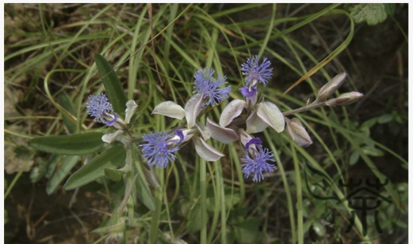
Polygala tenuifolia (Yuan Zhi)