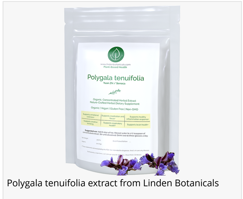
Polygala tenuifolia extract from Linden Botanicals

DENVER, CO, UNITED STATES, January 19, 2021 /EINPresswire.com/ -- Scientific studies suggest that Polygala tenuifolia herbal extract provides mood support and may ease anxiety, improve sleep quality, heighten creative thinking, help discharge repressed emotions, and enhance dreaming and manifested ideas. It may calm and relax the body by easing restlessness and anxiety. Its Chinese name, Yuan Zhi, translates to “high aspirations.”