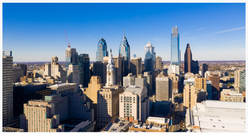
Major League Vacations - Philadelphia Skyline

"Our trips bring sports fans to exciting destinations, offering a multitude of attractions to see and